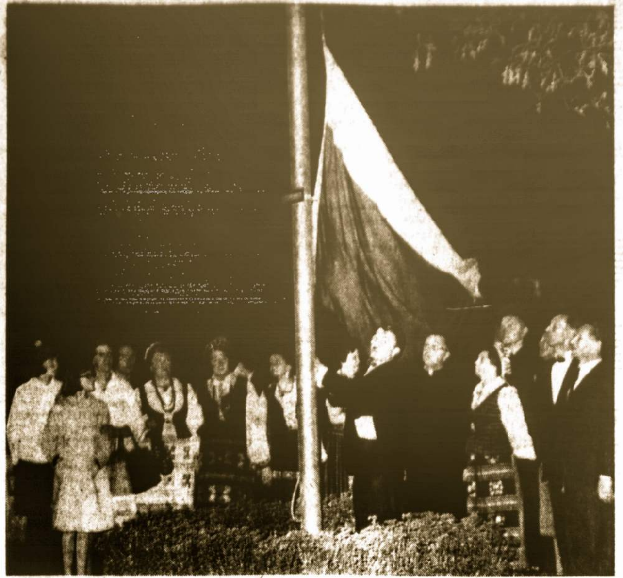
PASAULINEJE parodoje spalio 17 naktį paskutinį kartą nuleidžiama Lietuvos vėliava.

Nelaukitas Patarimas. — Daktare, kada aš turiu duoti vyrui miego miltelius? Jis atrodo toks pavargęs. — Jokiu milteliu jam neduok, bet pasi juos išgerk, kad jis galėtų pailsėti.