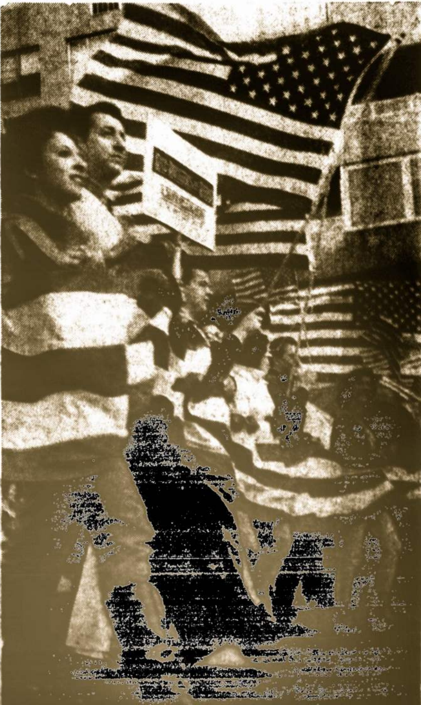
STUDENTAI NEW YORKO MANIFESTACIJOJE spalio 30 už vyriausybės politiką Vietnamo.

Simet Lietuvoje vykdoma stiprinta "tarybinių tautų draugystės" propagandos programa. Lankesi rusų, gudų, ukrainiečių (taip pat ir pabaltiečių) rašytojų ir kitokios delegacijos, o vėliausia (spalio 12) tokia delegacija į Vilniaus radiją, televiziją ir teatrų atvyko iš Kazachstano.