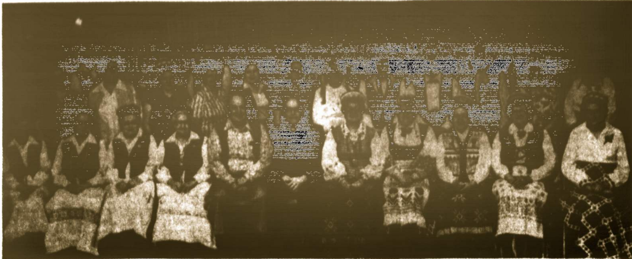
The Knights of Lithuania Council 143 of St. Casimir's Church, Pittston were one of the hosts of the National Convention of the K. of L. which was held at the University of Scranton.