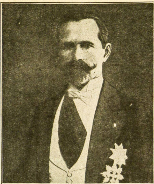
ANTANAS SMETONA, the first and present president of the Lithuanian Republic, has in no small way influenced the past progress of the land of our fathers.

If wisdom's ways you would early seek, Five things observe with care. To whom you speak, of whom you speak, And how and when and where.