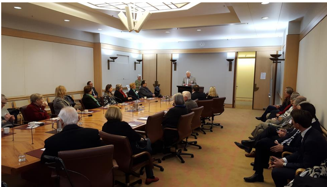
Some of the participants at the Canberra book launch.

Here is an edited excerpt of Al Taskunas' talk: