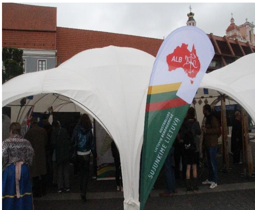
The Australian-Lithuanian stall at Tent City.

that there are Lithuanian communities in Turkey, Israel, the Netherlands and even Russia? In addition, Lithuanians from 30 different countries visited Lithuania for the centenary celebrations.