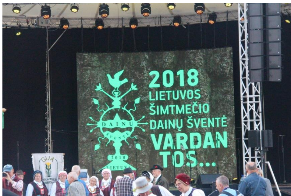
Centenary Song Festival in Vilnius, Lithuania.

At least seventeen members of the Canberra Lithuanian Community (CLC) travelled to Lithuania to enjoy and participate in the Centenary Song Festival. We all travelled at different times, via different routes and the durations of stay varied from a few days before the commencement of the festival to a day or two after it closed.