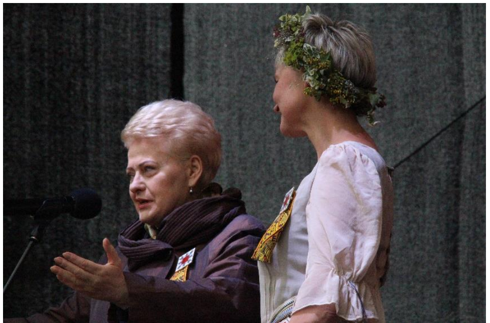
The President of Lithuania Dalia Grybauskaitė addressing the crowd at Tent City.

July 1: At Daukanto Square, precisely at mid-day, Dalia Grybauskaitė, the President of the Republic of Lithuania, presided at the opening of the week-long festivities. It was quite a thrill to see the flags of Australia and the Australian Lithuanian Bendruomenė (ALB) raised on high above the assembled crowd.