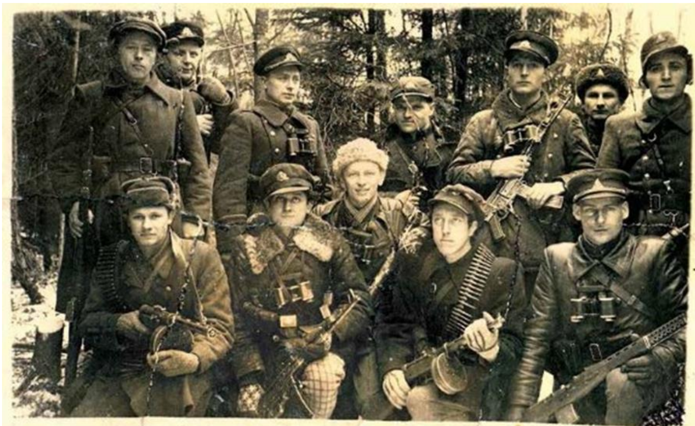
Vanagas (front, centre) with his “forest brothers”.

which spewed out of Moscow. Mr Putin's equivalent of a press secretary pronounced Vanagas (whose real name, incidentally, was Adolfas Ramanauskas) a fascist and murderer, a common criminal. That news grab was replayed often on Lithuanian TV and became almost like a comment itself.