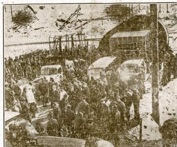
Scena prie Willow Grove angliakasyklų St. Clairsville, Ohio, kur įvyko baisi eksplozija ir užgriuvo 200 mainierių, 19 lavonų jau išmėta. Dar yra užgriutu 52. Jų likimas nežinomas.

Geneva. — Ir vokiečiai ir lenkai labai susirupinę kaip apsiginti nuo ligų kada Lenkijoj prasidės paleidimas. Karas paliko daug dalykų pavojingų sveikatai. Atsilius gali ligos prasidėti.