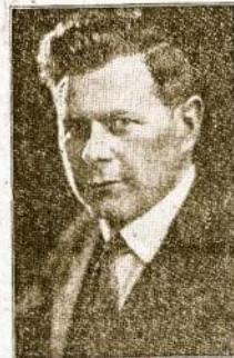
PŪVILAS STOGIS žymusis lietuvis Basas.