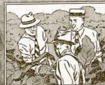
Jis LENGVESNI. Prieš visio Ispaniavimo laikų Chesterfield's gėrybe tabakė pūdikai peršuro apgundys jėvėi toki kod i pirmos rankos stėnesioje ir kur pašėlovisis lengvas, suuokė lopos pavėna. Kaip Elie tabakai pririnkėti, amonkėli ir sumoniję tas duoda Chesterfield's geresnį stonį ir padaro jėvėi atkėli lengvesnis.

AR JŪS RUKOT CIGARETĄ, KURIS Patenkina... JIS YRA RŪKYTOJO CIGARETAS