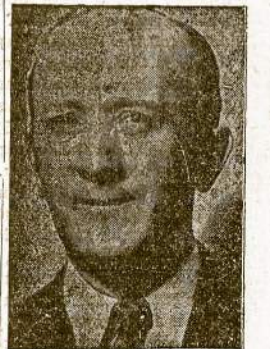
WILLIAM Z. FOSTER

William Z. Foster, noted labor leader will be the main speaker of the evening. The meeting will open at approximately 8 P. M. It will be held in the outside stadium arena which has been set up for gatherings during the summer season.