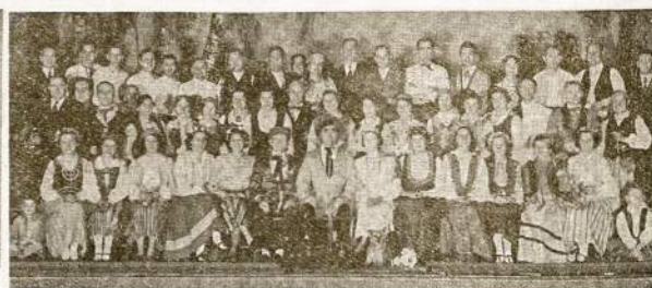
CHICAGO LATVIŲ DARBININKŲ DRAUGIOS CHORAS

Tuojaus įsigykit įžango tikietus. Iš anksto 85c, prie durų bus $1.10. Bilietus galite gauti "Vilnies" raštinėj ir pas platintojus.