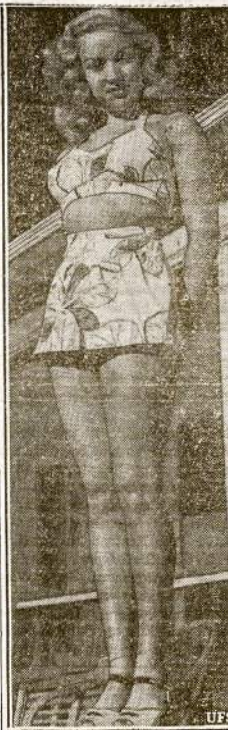
BETTY—One of reasons why California sun likes to stick around probably is lovely Betty Grable, screen star. On clear days she frequently can be seen basking in the sunshine at Hollywood, like this. Hollywood has sub-tropical climate.