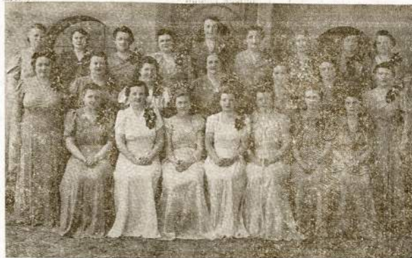
CICERO MOTERŲ CHORAS