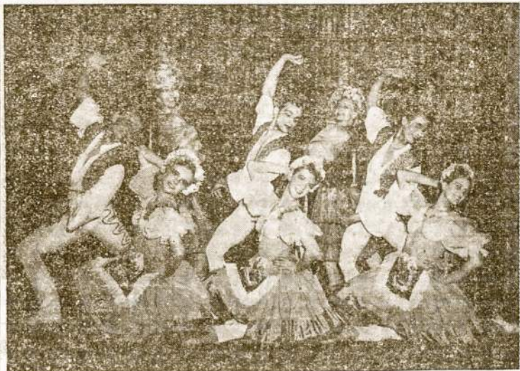
The Palette Ballet, an ensemble of seven dancers who have a notable reputation and will be one of the star presentations at the concert.