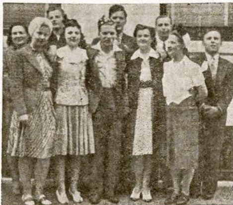
A group of LDS delegates to a conference which was held in Philadelphia last year. Representing some five states, these youth are now involved in LDS convention preparations. The current membership drive now has all these individuals vying competitively against one another.

"It is a pity and a shame that other Lithuanian-American fraternal organizations which have been organized for two score or more years, did not set an example for us to follow. They have once before been faced with a similar problem. Present day aggression like time,