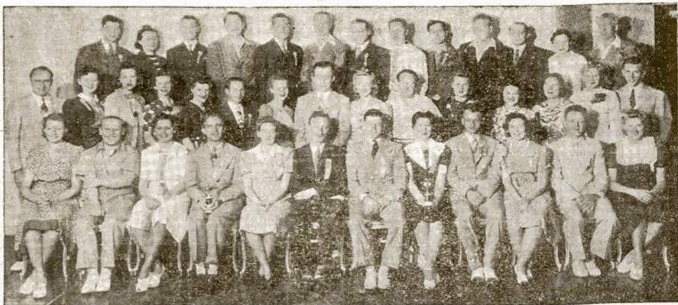
Midwest members of the LDS on whose shoulders now lies the task of making all arrangements in connection with the National Youth Conference and National Track and Field Meet which will take place in Chicago on July 20.

They will not lay down their arms until the freedom which they so recently tasted is won back.