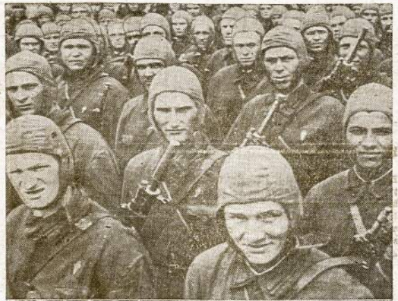
Red Army parachutists who today are being dropped behind Nazi lines and are wrecking communications, blasting bridges, and creating general havoc. Soviet Russia was the first nation to foresee the value of these forces and initiated many young men into this branch of service.

Grastchenkov is only one of many thousands mobilized to fight wounds and diseases in