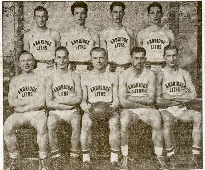
Ambridge, Pa., LDS basketball team. Today these fellows are readying themselves for softball season and are expected to participate in the LDS National Track and Field Meet which takes place in Chicago on July 19.