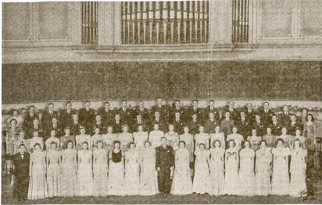
Chicago's L. K. M. Chorus who presents Sigmund Romberg's "Student Prince" this Sunday at Sokol Hall. About 100 persons will participate in the staging of the operetta. Curtain is at 3 P. M. Sharp. Tickets sell for 99 cents. Sokol Hall is located at 2343 S. Kedzie Avenue.