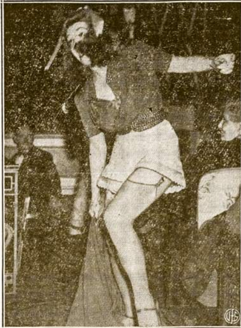
MADCAP SHOW —Audience in new Olsen and Johnson show, "Sons o' Fun," opening on Broadway, New York, recently, gets many surprises. Here's showgirl planted in the audience who suddenly arises and begins to remove dress.