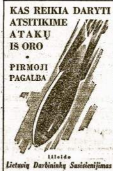
Reduced cover page of "Civilian Defense Pamphlet" published by The Association of Lithuanian Workers (LDS).

Ten thousand copies of the pamphlet have been sent to all branches of the organization and are currently being distributed to the members and other people of Lithuanian origin who have difficulty in reading the English language.