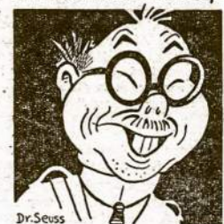
Dr. Seuss BUY WAR SAVINGS BONDS & STAMPS