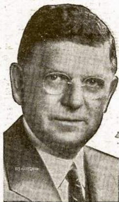
Mayor Edward J. Kelly

Convening at a most proper time, when the utmost unity of effort is needed, the association will pave a path for Lithuanian-America to follow.