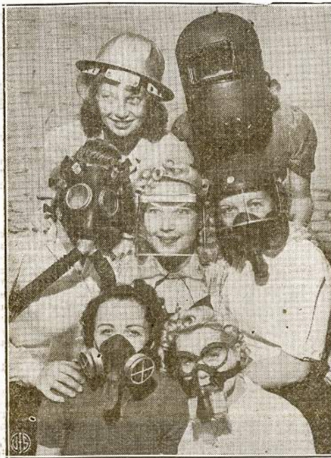
WAR STYLES—Variety of hats and masks are worn by these war-working girls in Los Angeles. Girls are employed on assembly lines of some of the big war plants and use hats or respirators made necessary by nature of their labors.