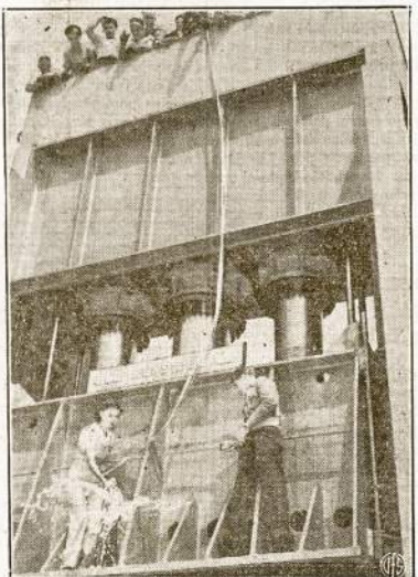
Didžiausia pasaulyje automatiška mašina. "Old Ironside," kuri neseniai įtaisyta vienoje orlaivų irbtuvėje Los Angeles. Mašina-pressas turi 1,100 tonų spaudimo jėgą ir vienu kirčiu pagamina tam tikrą didelę dalį Liberty orlaivo.

OTTAWA.—Kanadoje pradėta plati darbo jėgų mobilizacija. Darbas yra privalomas visiems, ir tie kurie nedirba, tam tikrų komisijų galės būti nurodyti, kur jie būtinai turi dirbti. Be to darbininkai be tam tikrų leidimų negali aplieisti darbo vietų.