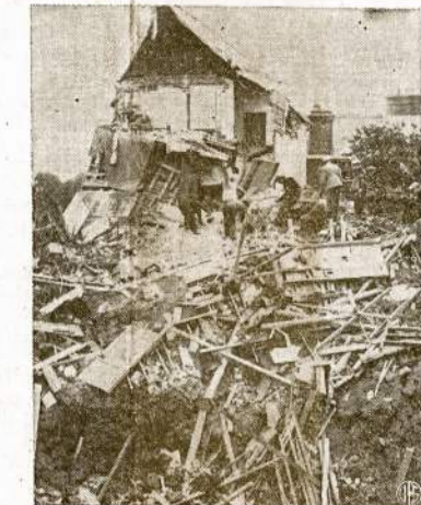
GRIUVESIAI NACIŲ BOMBARDUOTO Miesto KAKUR ANGLIJOJE

TOKIO (radio pranešimas).—Kartu su užsienio reikalų ministru Togo rezignavo ir jo padėjėjas Harohito Niši.