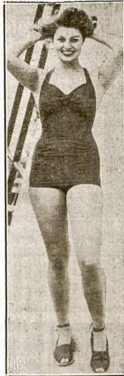
NIFTY NYMPH —Miss Gloria Callen, who is defending her national title in the 100 meter back stroke event at Women's National A. A. U. Championships, Neenah, Wis., is easy on the eyes, be she in or out of the water.