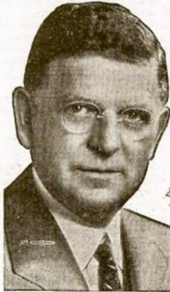
Mayor Edward J. Kelly

WHEREAS, during this month the following events significant in the independence and development of our country occurred: The Definitive Treaty of Peace signed by England September 3, 1783, and by which that country recognized the independence of the United States; September 6, this year linked with Labor Day, and also known as Lafayette-Marne Day; September 11, which recalls the historic meeting on Staten Island in 1776 between Benjamin Franklin and Lord Howe when Dr. Franklin reconsecrated the United States to the cause of Liberty; September 13 and 14 bring to mind the attack in 1814 on Baltimore of the Fort McHenry during the course of which Francis Scott Key was inspired to compose our National Anthem; September 17 has long been commemorated as Constitution Day; September