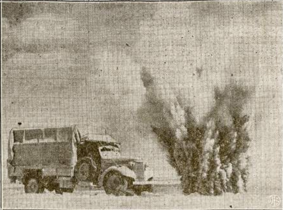
Kuotik nesutiko mirtį Afrikos tyrnose, šis Susijungusių Tautų reikėmų pristatymo trokas, kaip matyti paveiksle, vov spėjęs sustoti keliam pėdom atstu nuo vietos, kur sprogo iš nacių orlaivio išmesta bomba. Troko vairuotojas nei fotografas nesužeisti.

BELFAST.—Policija susėkė slaptą amunicijos sandėlį, kur rasta nemažai šautuvų, revoliųrių, granatų ir tt. Vienas airis tapo nušautas, kada policija tą sandėlį užtikė.