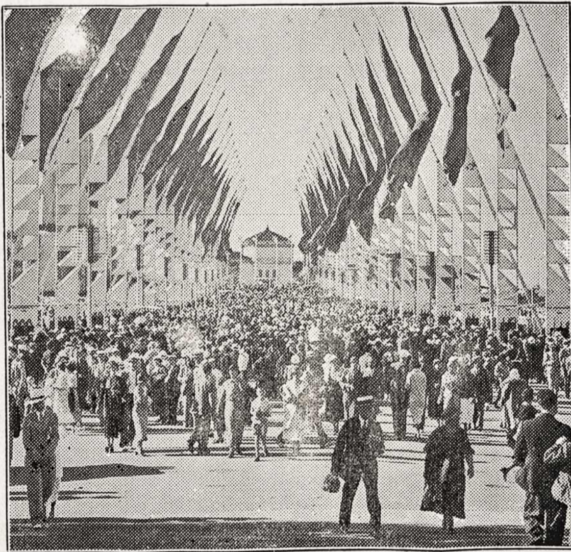
Chicago World's Fair "The Avenue of Flags"