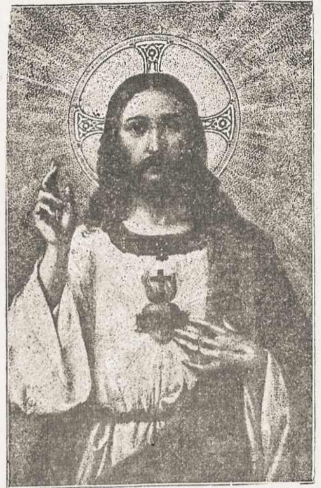
BIRŽELIS — ŠVENČ. JEZAUS ŠIRDIES MĖNUO