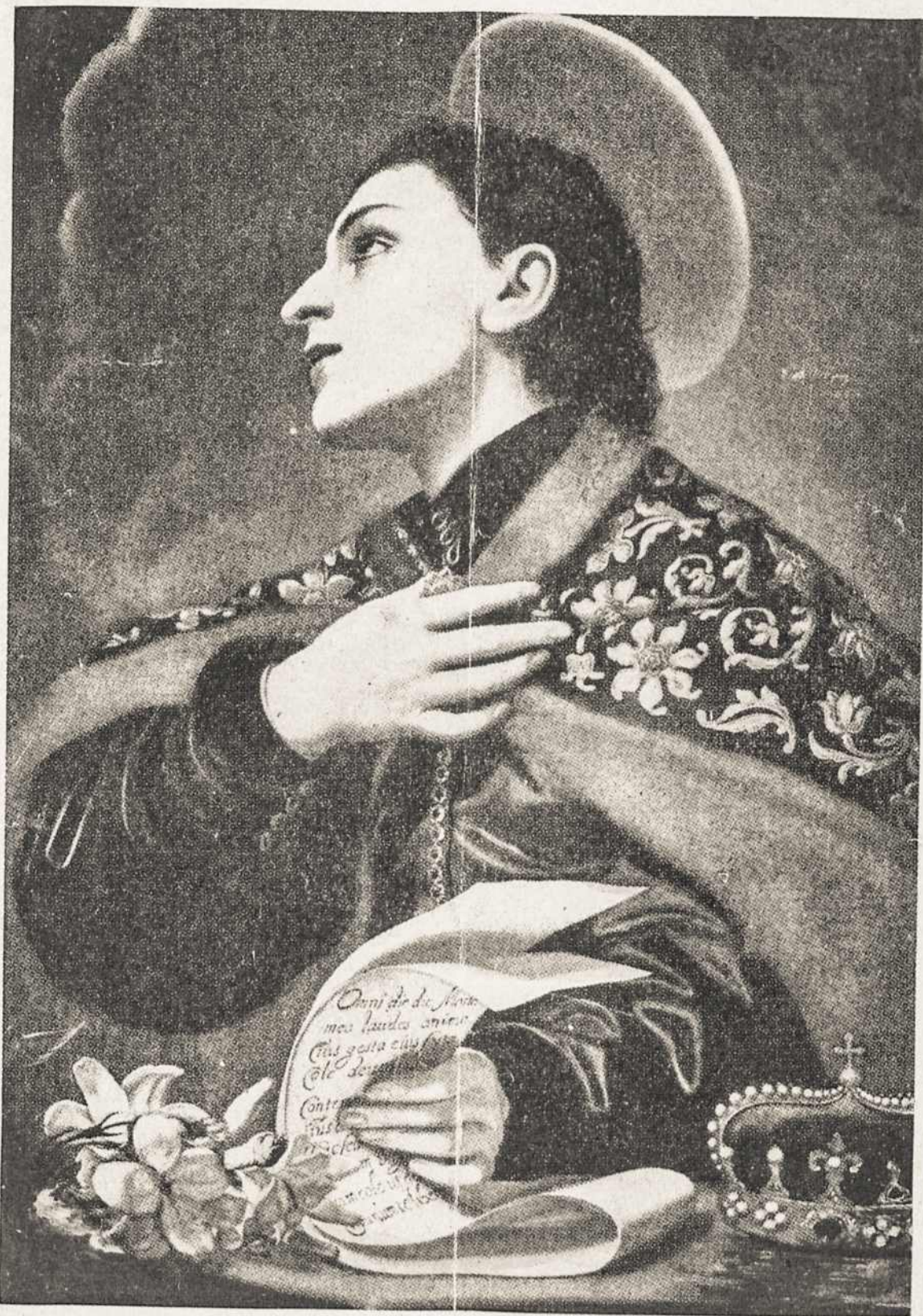
THE PATRON SAINT OF THE KNIGHTS OF LITHUANIA