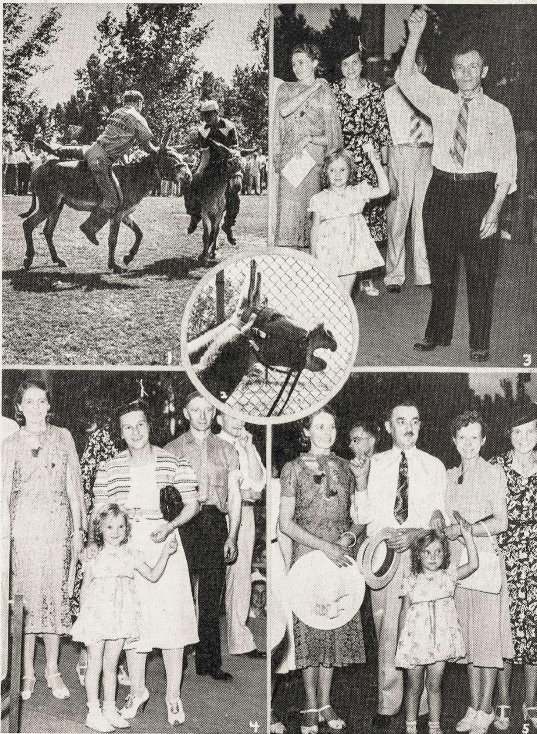
1. "Donkey Baseball" Lošimas.