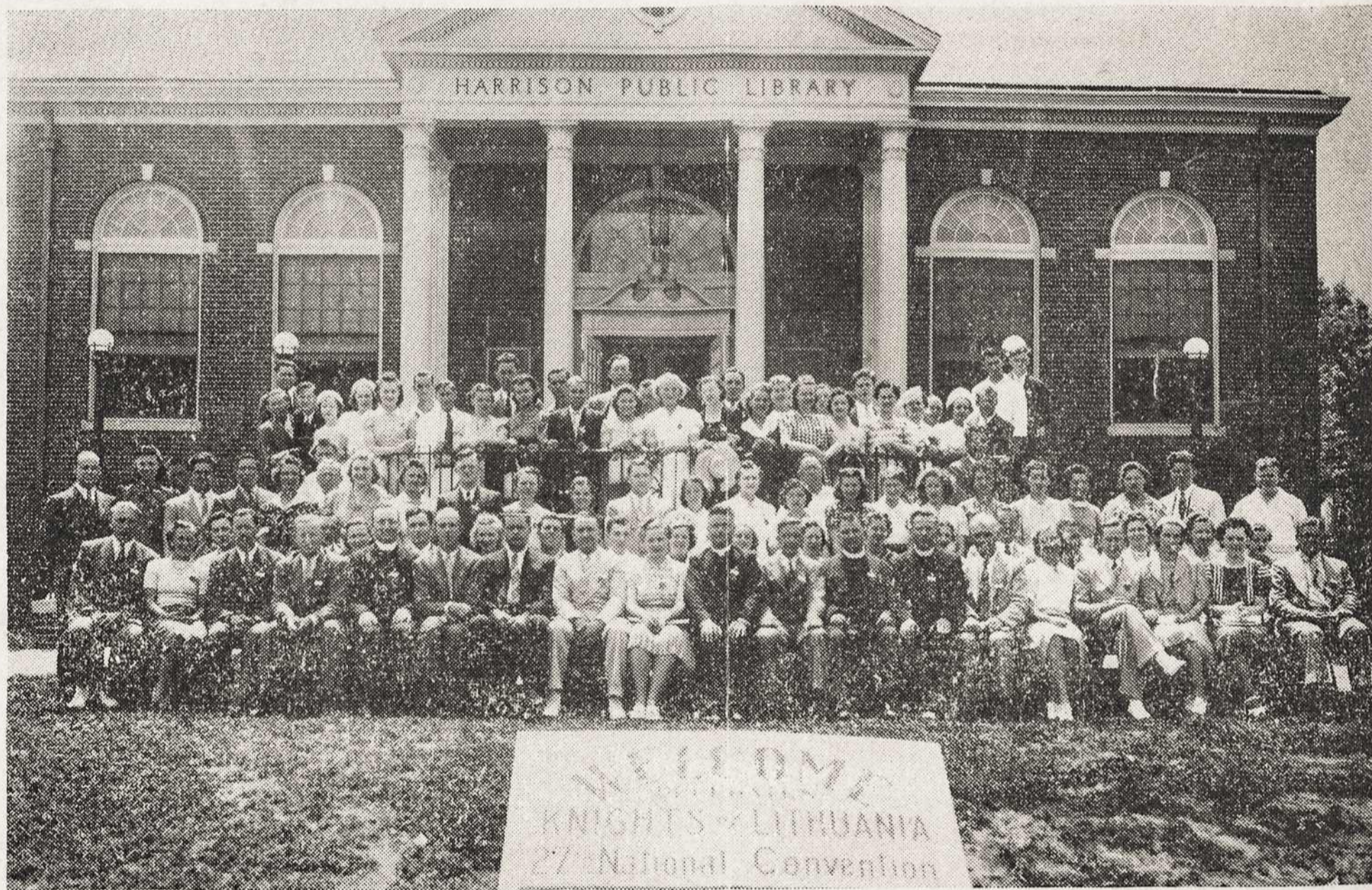
XXVII SEIMO DALYVIAI PRIE HARRISON PUBLIC LIBRARY KUR BUVO LAIKYTOS ŠIO SEIMO SESIJOS

STUDENTU ZODIS Marianopolis College Thompson, Conn.