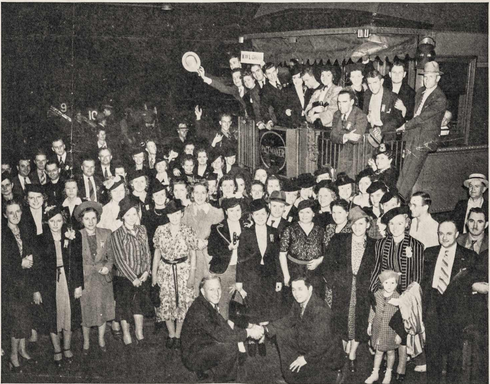
THE CHICAGO DISTRICT KNIGHTS OF LITHUANIA CHOIR LEAVES FOR THE LITHUANIAN DAY AT THE NEW YORK WORLD'S FAIR

STUDENTU ZODIS Marianpolis College Thompson, Conn. ON TO NEW YORK!