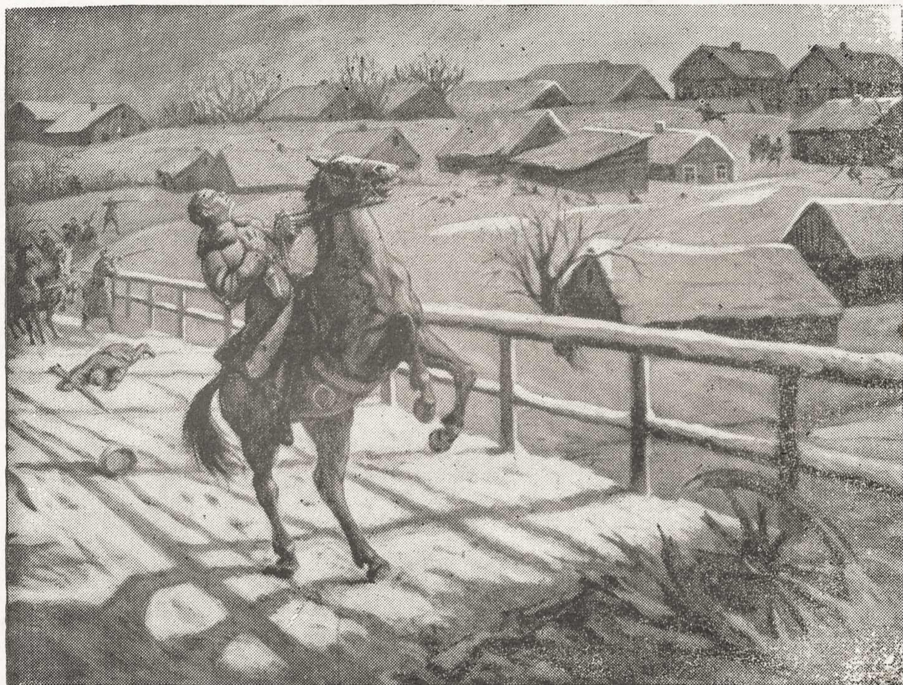
KARININKAS JUOZAPAVIČIUS ŽŪSTA KOVOSE DĒL LIETUVOS NEPRIKLAUSOMYBĒS