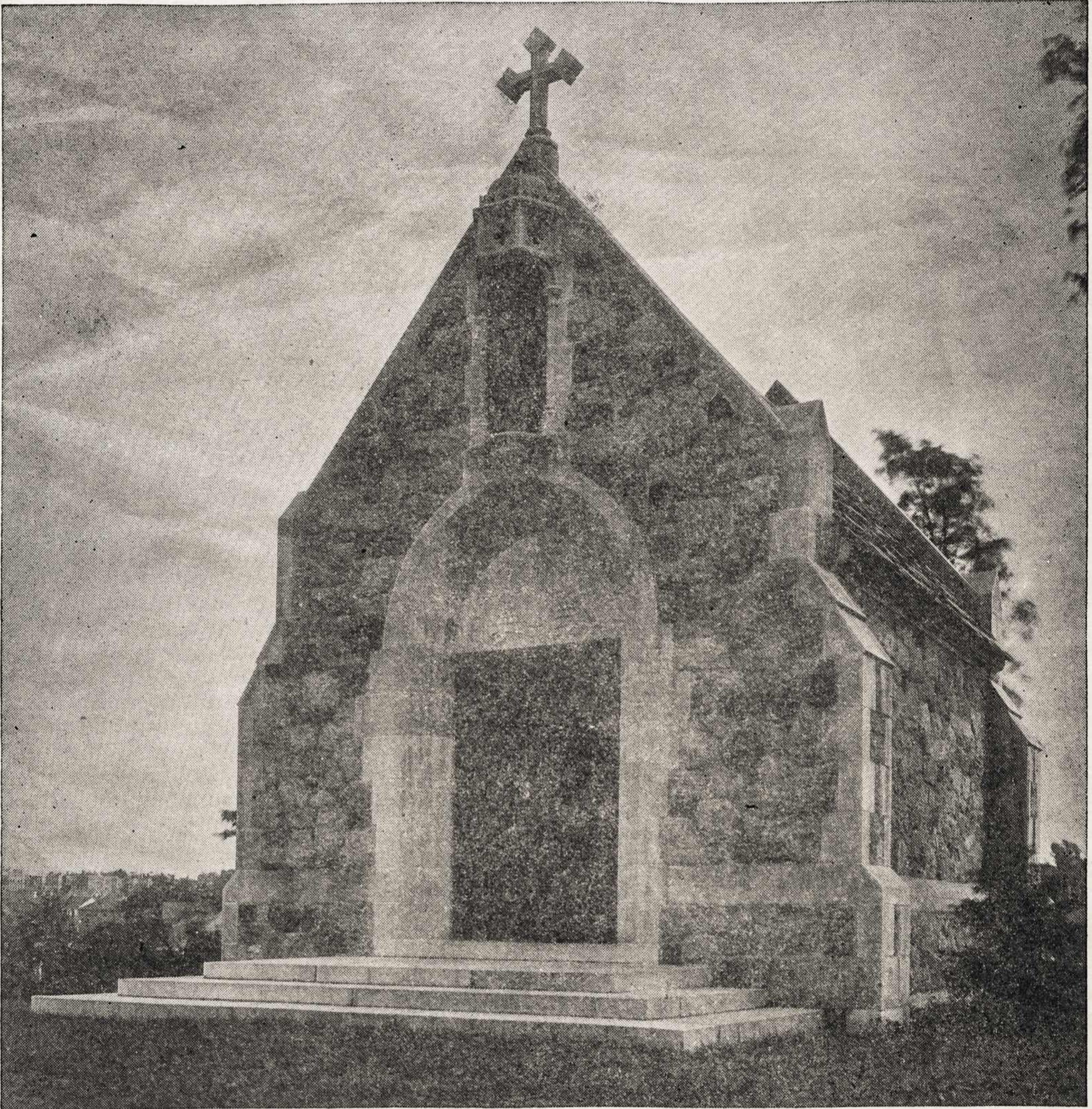
The Crypt on the grounds of St. John's Seminary, dedicated by His Eminence in 1928, which becomes his final resting place.

The light of his long life is only a brief candle in comparison with the enduring light of the inspiration he has bequeathed to us. Tomorrow and tomorrow and tomorrow we shall be enriched and ennobled by the abiding influence of his myriad of lasting works.