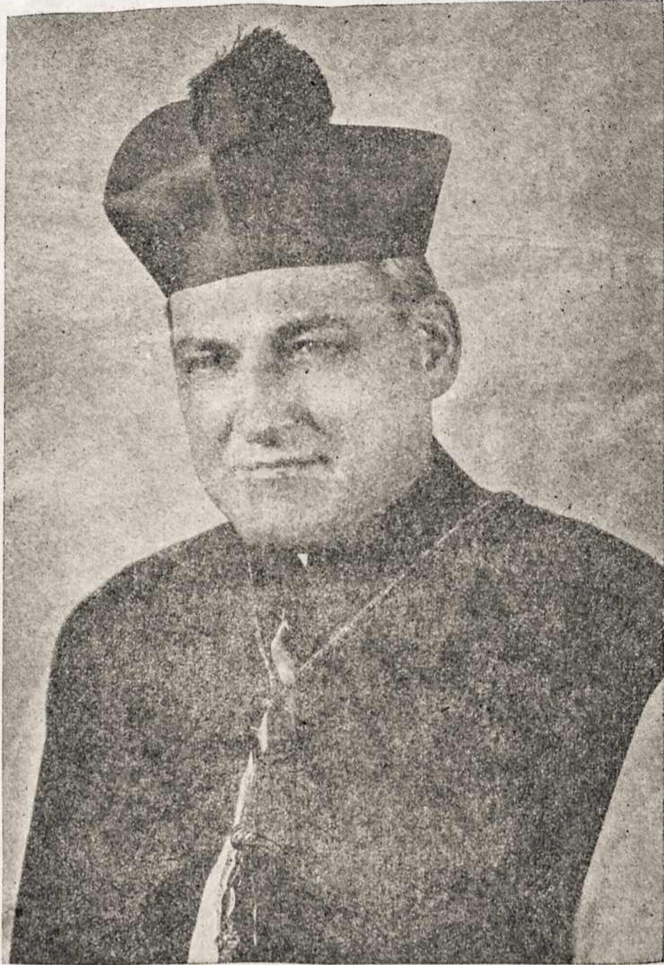
Most Reverend Richard J. Cushing, D. D., Auxiliary Bishop of Boston Administrator of the Archdiocese.

The cause of God was his consuming passion, and he defended that cause with life-long devotion and singleness