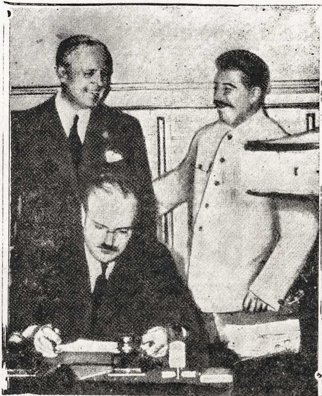
Stalino ir Hitlerio Susitarimas 1939 m. Rugpiūčio m., kuris davė galimybės Sovietų Sąjungai 1940 m. birželio m. okupuoti ir Lietuvą. Čia matome stovinčius ir linksmi bešnekučiuojančius Staliną su Hitlerio Užsienių Reikalų Ministe Hu von Ribbentrop , kai tuo tarpu Sovietų Sąjungos Užsienių Reikalų Komisaras Molotov pasirašo sutartį.