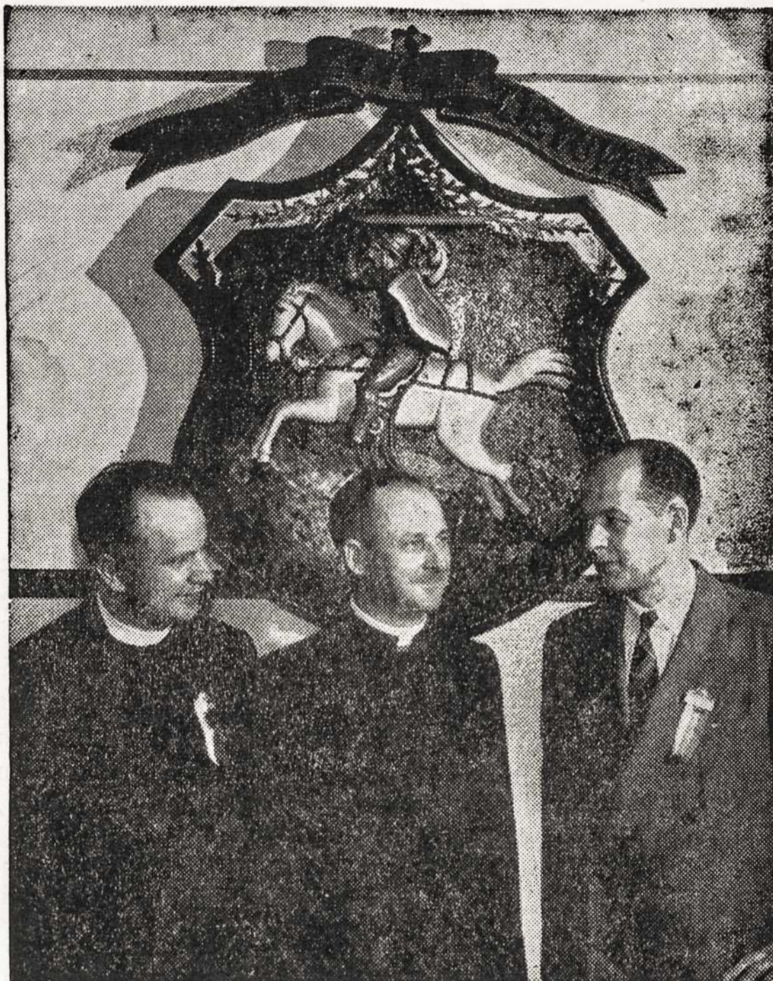
Dayton Daily News