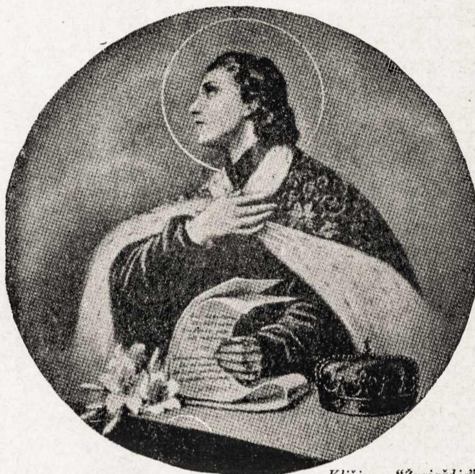
Klišė — "Žvaigždės"

Kasmet kovo 4 d. ne tik mes, bet ir visas katalikų pasaulis mini Šventojo Kazimiero šventę. Tos šventės proga atsimenamas jo asmuo ir jo sektinos dorybės, galinčios būti puikiu pavyzdžiu kiekvienam iš mūsų. Visai suprantama, kad mes lietuviai taja švente daugiau domimės, nes tai šventė vienintelio mūsų tautos žmogaus, kurį oficialiai Katalikų Bažnyčia paskelbė šventu. Nereikia daug aiškinti, jog šventų žmonių mūsų tautoj yra buvę labai daug, jų yra dabar ir bus ateity. Šiandieninė Lietuvos tragedija yra pareikalavusi nesuskaitomo skaičiaus kankinių už Dievo ir Tėvynės idealus. Neabejojame, kad nutilus audroms ir gyvenimui grįžus į žmoniškumo vėžes, išryškės daugybė naujų šventųjų, kuriuos ir Bažnyčia tokiomis paskelbs. Betgi tuo tarpu siekdami pavyzdžio asmens šventumui pabrėžti, visada sustojame ties tuo jaunu šventuoju, kuris gimė lietuviškos kilmės Lietuvos ir Lenkijos valdovų šeimoj ir kuriam buvo skirta pačiam tapti valdovu. Atsisakęs siekti žemiškosios valdžios, paaukojęs savo neilgą gyvenimą Dievo