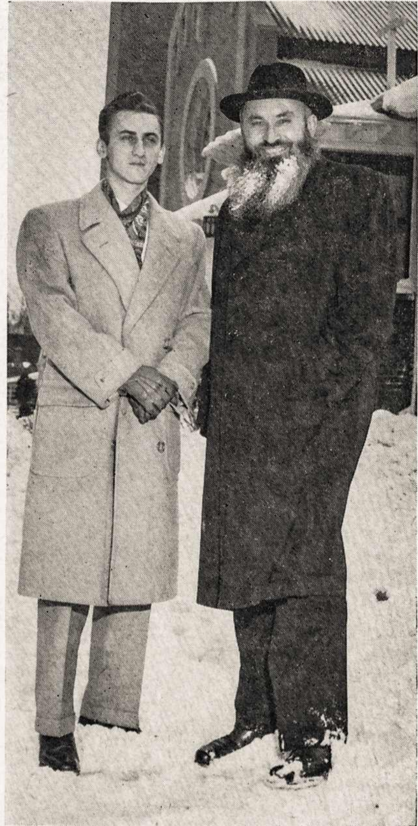
"Lietuvių Dienų" klišė

Venezuela will probably go down in his books as the most adventurous, however. The priest, whose place he took when coming to Venezuela,