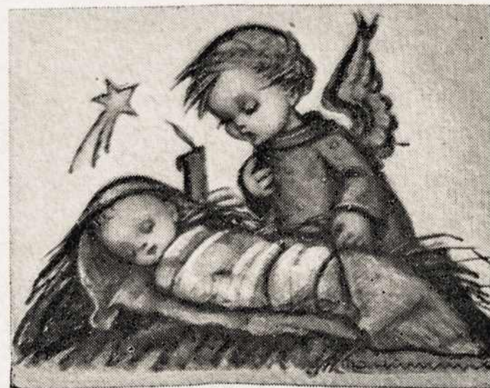
Augina Lietuvai naują vyti.

(The editors invite K. of L. readers to contribute to this department by sending in their own humorous anecdotes, jokes, or plain corn. Include name and council of sender so proper credit can be given. Address to TOP THIS editor, 201 K. St., So. Boston 27, Mass.)