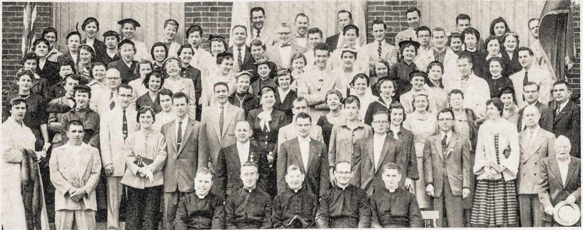
K. of L. attending their Semi-Annual New England District Convention at S. Boston, Mass. September 25, 1955.