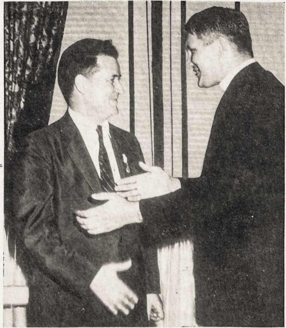
Honored at the Knights of Lithuania Conventions

Lithuania needs many friends who will remember her and speak up for her right to freedom. The action of so many civil officials in commemorating the anniversary of Lithuanian independence is all the more praiseworthy and gratifying, because they are not of Lithuanian blood and have no personal ties with Lithuania. To express the appreciation of Lithuanians on both sides of the Iron Curtain to friends of Lithuania the Knights of Lithuania hit upon a unique plan: the KNIGHTS OF LITHUANIA AWARD. The purpose of the award is to honor a non-Lithuanian who has most distinguished himself as a friend of Lithuania.