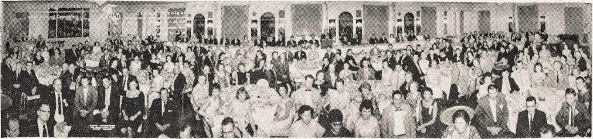
A GENERAL VIEW OF THE CLOSING BANQUET OF THE 46th K. OF L. CONVENTION IN DETROIT

and the Legion of Merit and participating in three Presidential unit citations.