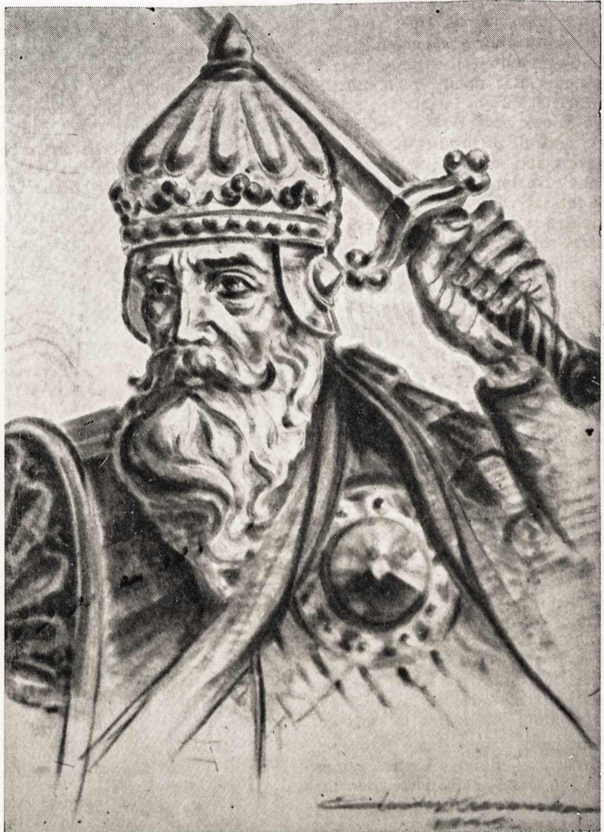
Mindaugas, Lietuvos valstybės ikūrėjas

The old prince pointed with his hand toward the sunlight and simply said, "The sun warms". The woman joyfully smiled and quickly left the room; soon the castle became