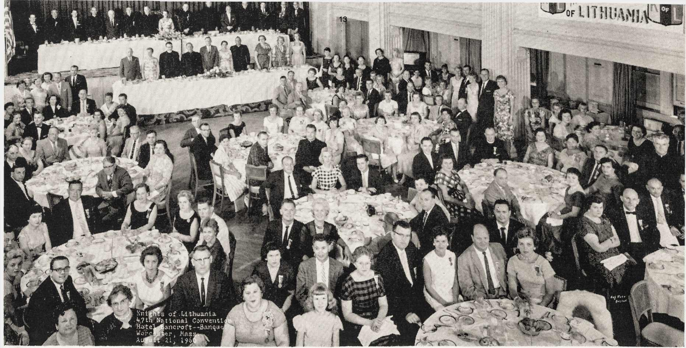
Knights of Lithuania 47th National Convention Hotel Bancroft - Banquet Worcester, Mass. August 21, 1960