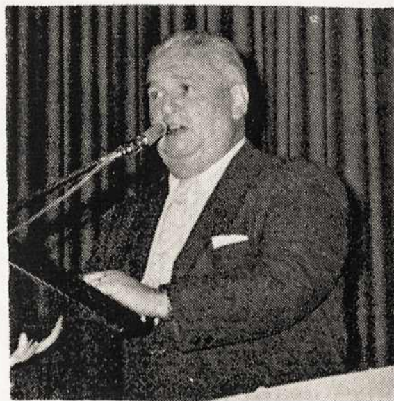
Hon. James O'Brien, Mayor of City of Worcester