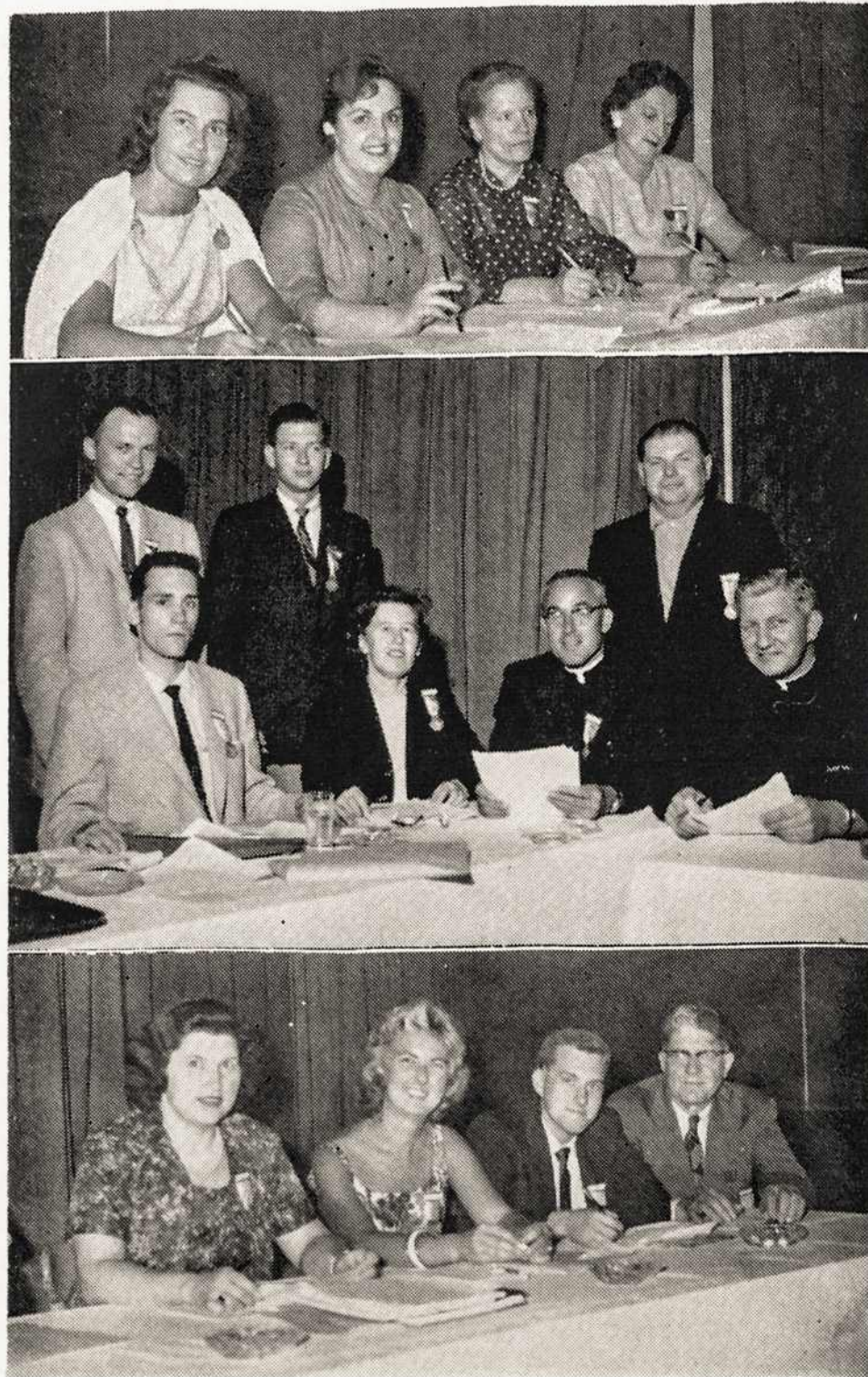
OPENING SESSION. Top to bottom, Mandate, Resolutions and Greetings Committees elected.

Because of his fearlessness in condemning communism and its consequent evils, because of