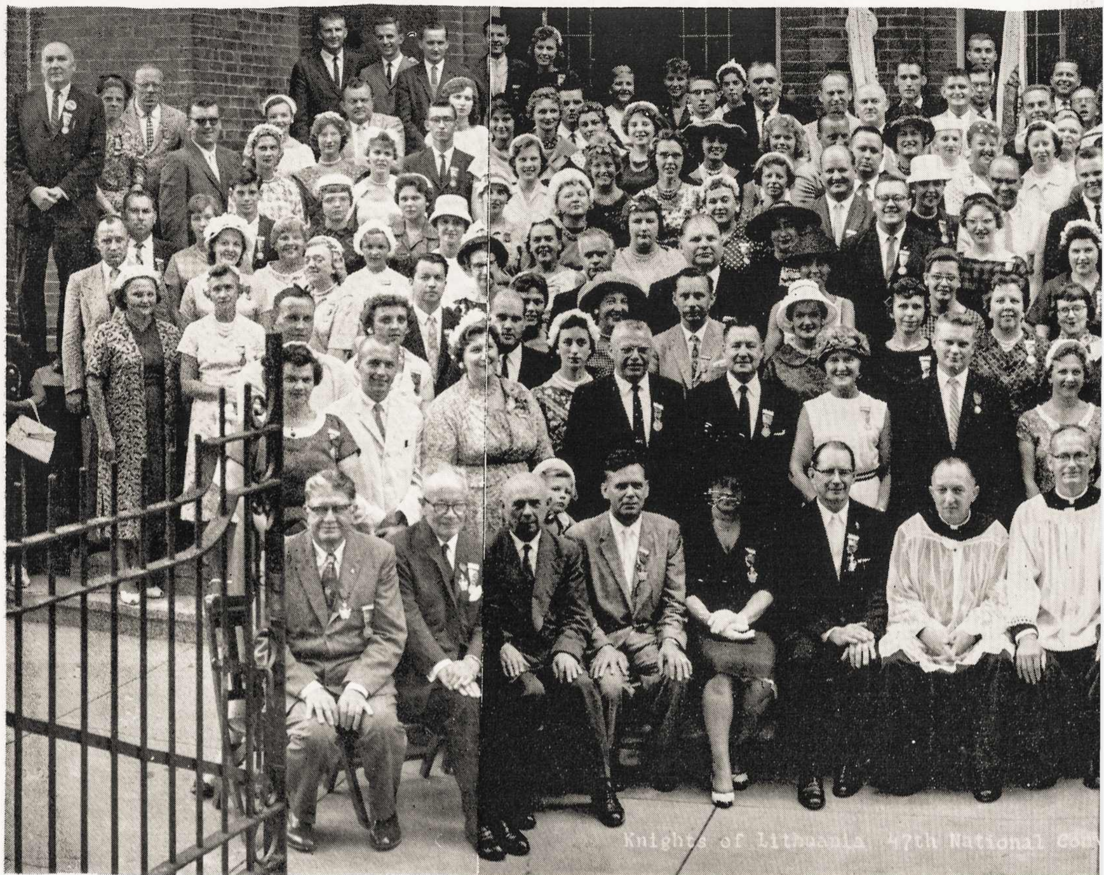
Lietuvos Vyčių Seimo Dalyviai Po Pamaldų Prie S