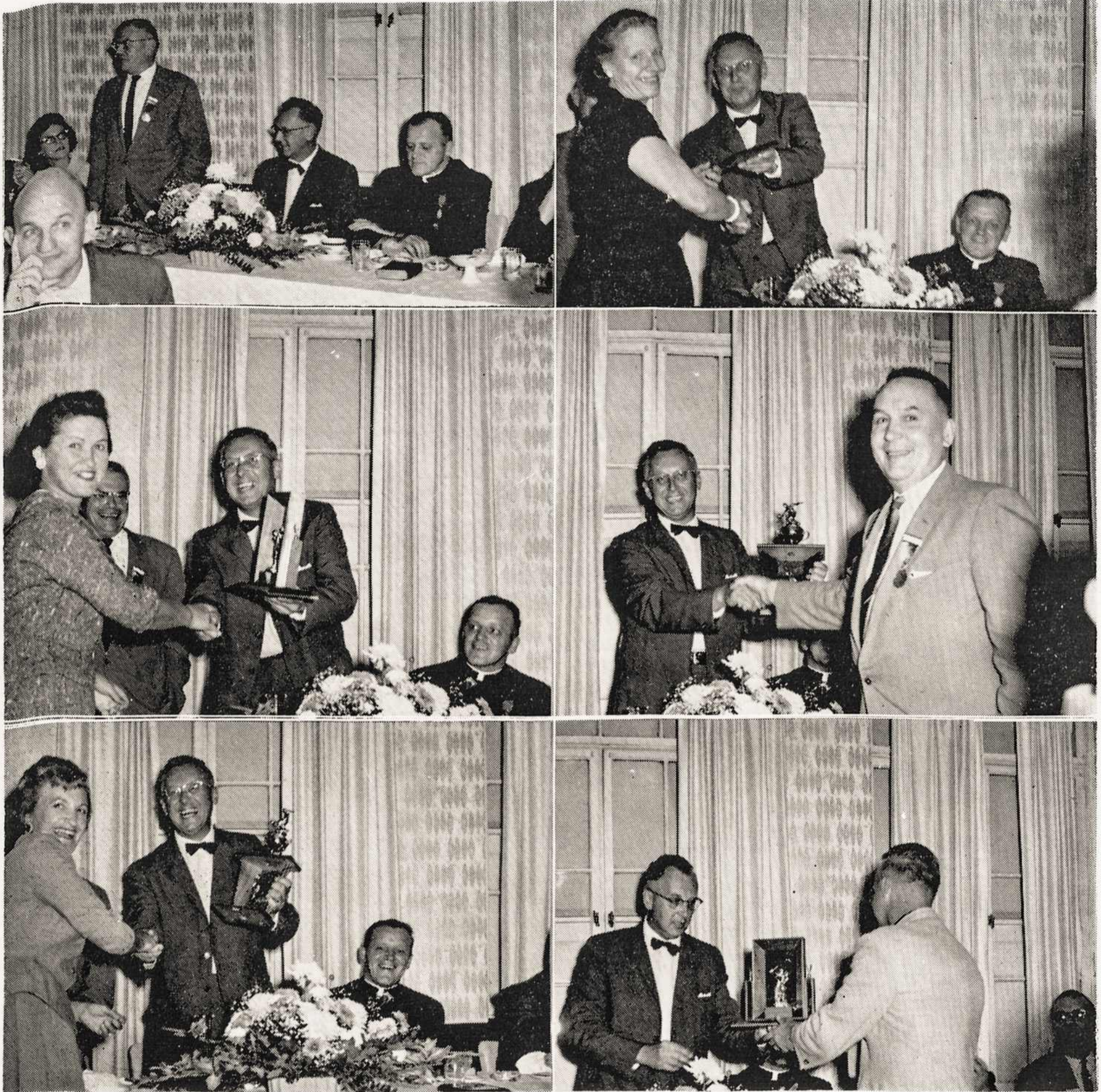
AWARDS GIVEN AT SPORTS LUNCHEON

of division within the Kremlin, unrest in the satellites and hard bargaining on the part of the West will induce the Soviets — in their own interest — to grant freedom to the unyielding, troublesome captive peoples of Europe.