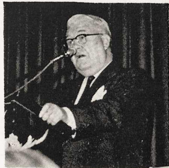
Congressman Harold Donohue (Worcester)