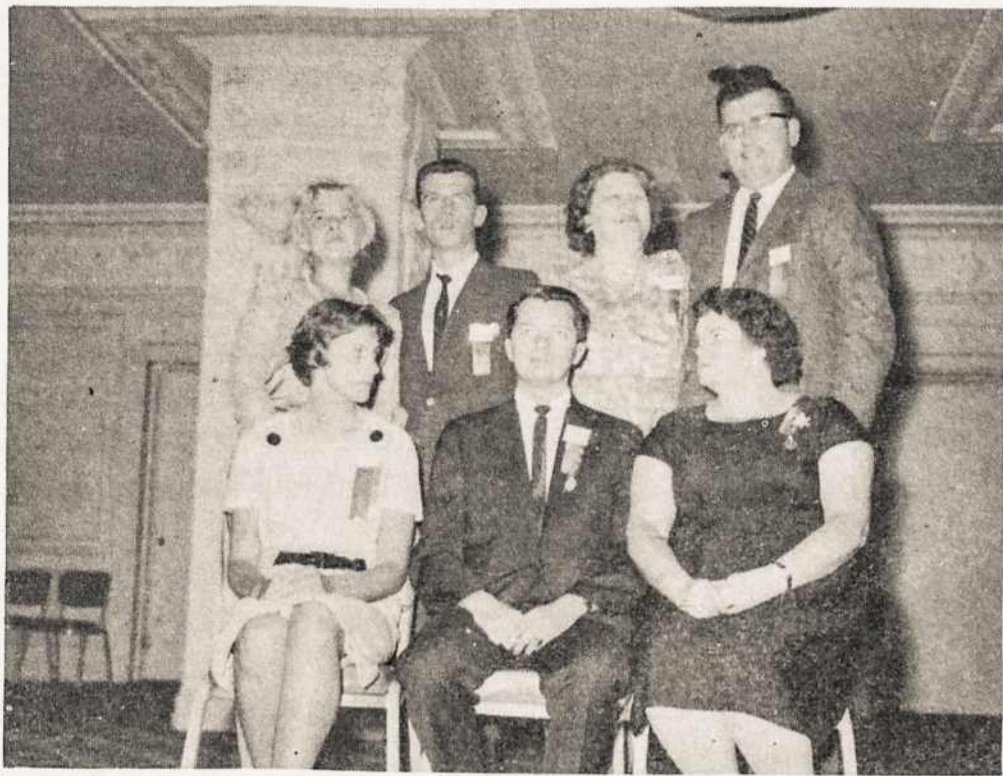
Your Executive Board For 1961-1962 Term