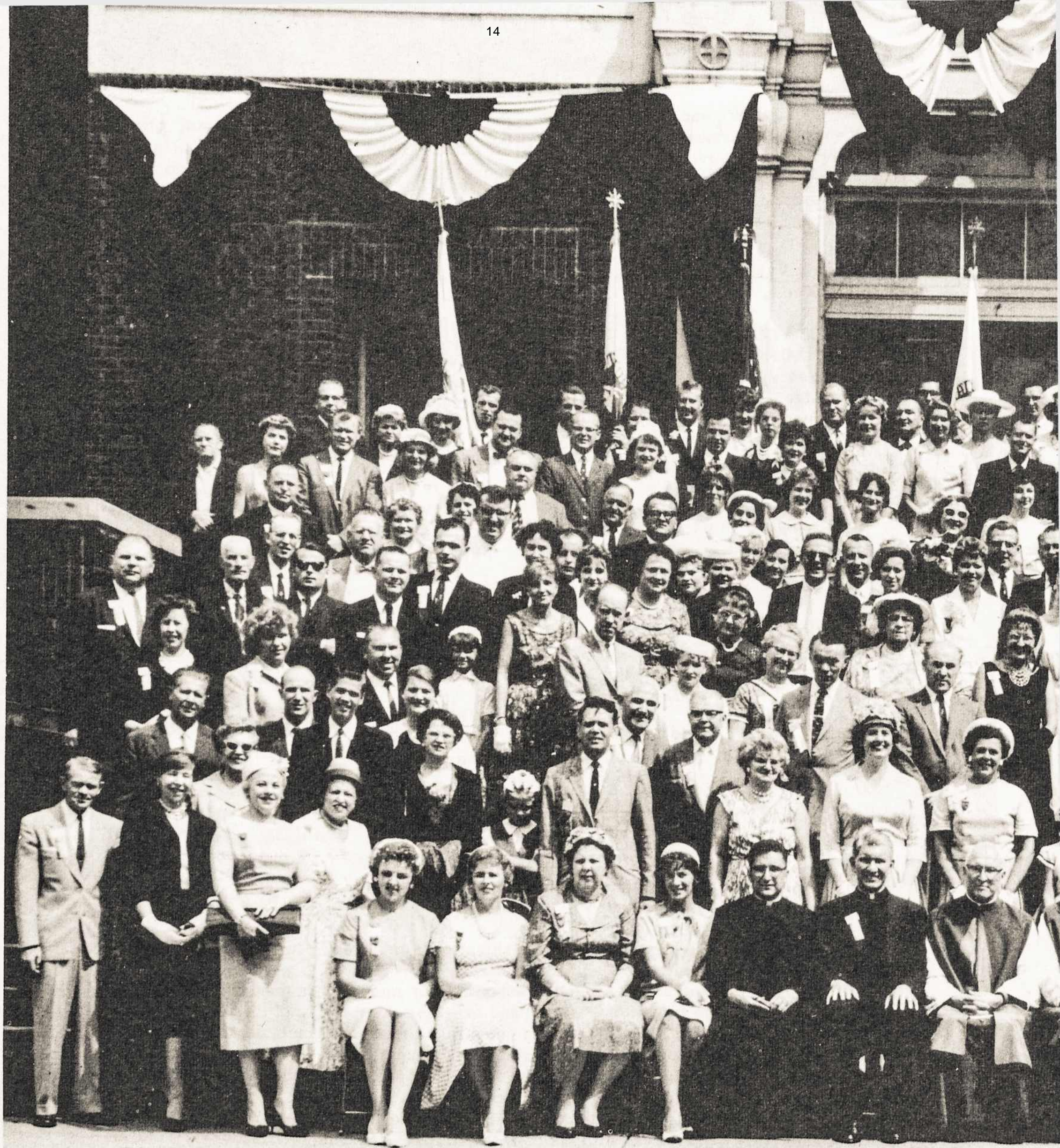
THE KNIGHTS OF LITHUANIA 48th National Convention Cleveland, Ohio August 24-27, 1961