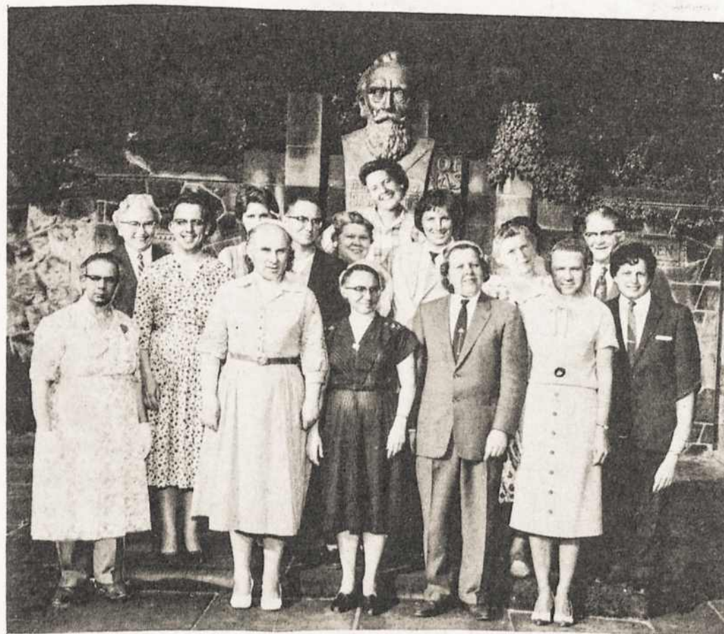
The 48th National Convention Committee worked so hard some of them even lost their heads!