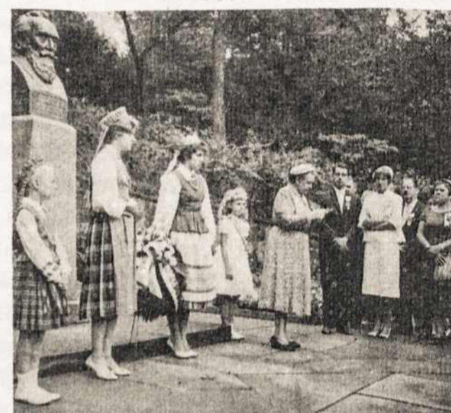
Cultural Garden ceremony