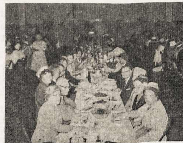
Scene from Sunday Brunch