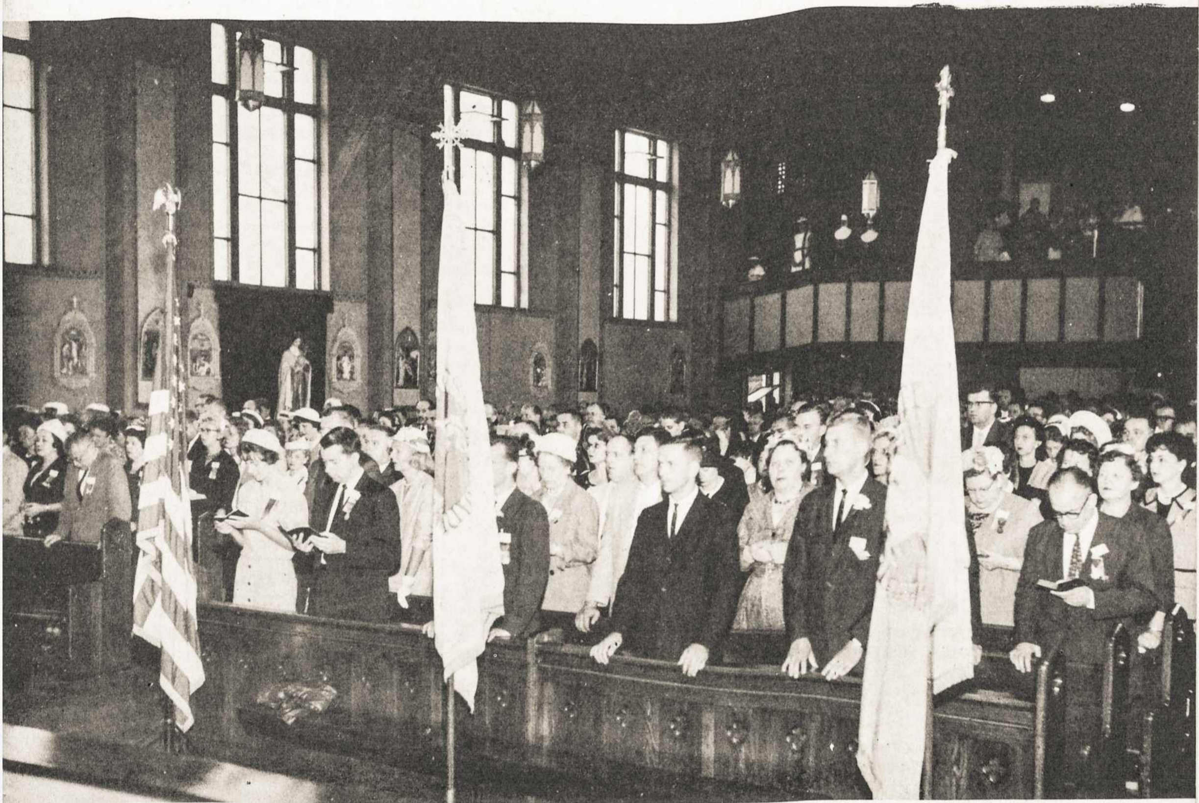
48th National Convention Solemn High Mass. Sunday, Aug. 27, 1961 - St. George's Church, Cleveland, Ohio