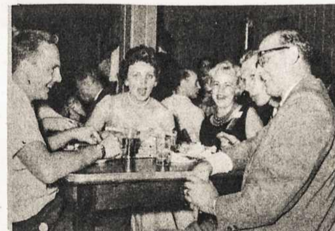
Scene from the Vyciu Wedding Reception