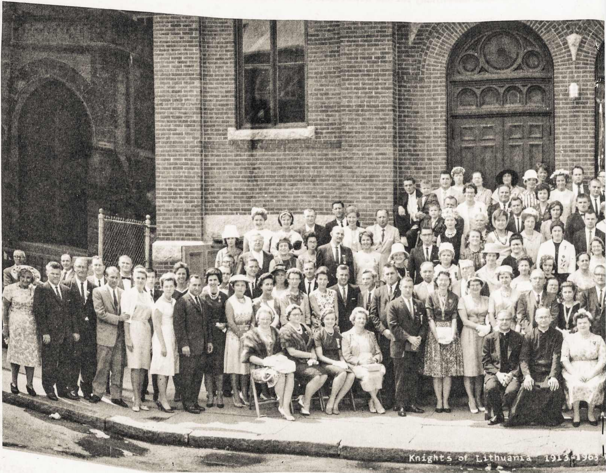
Knights of Lithuania 1913-1963