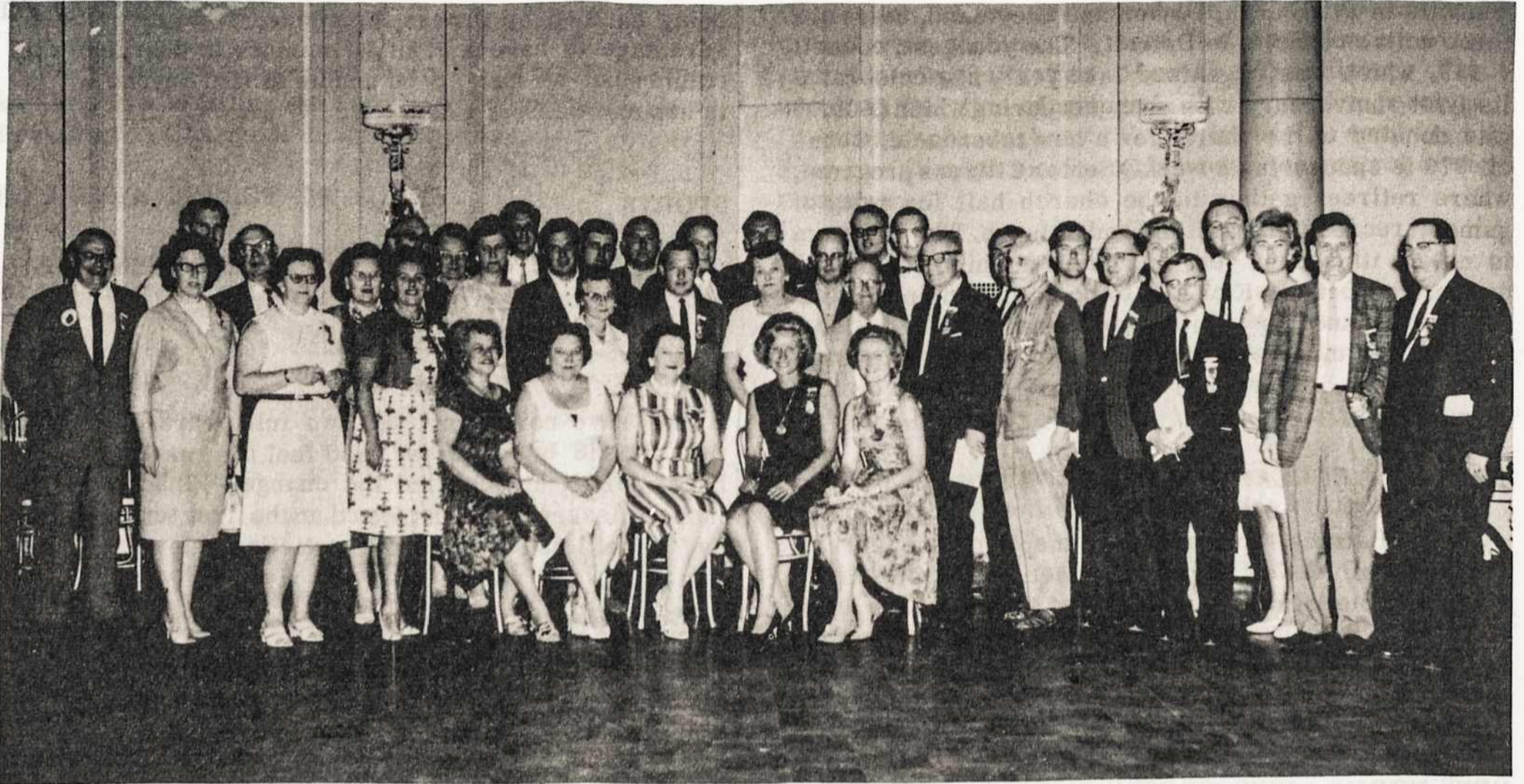
Former council and district presidents gathered in the session room for a 50th Anniversary Convention photo.