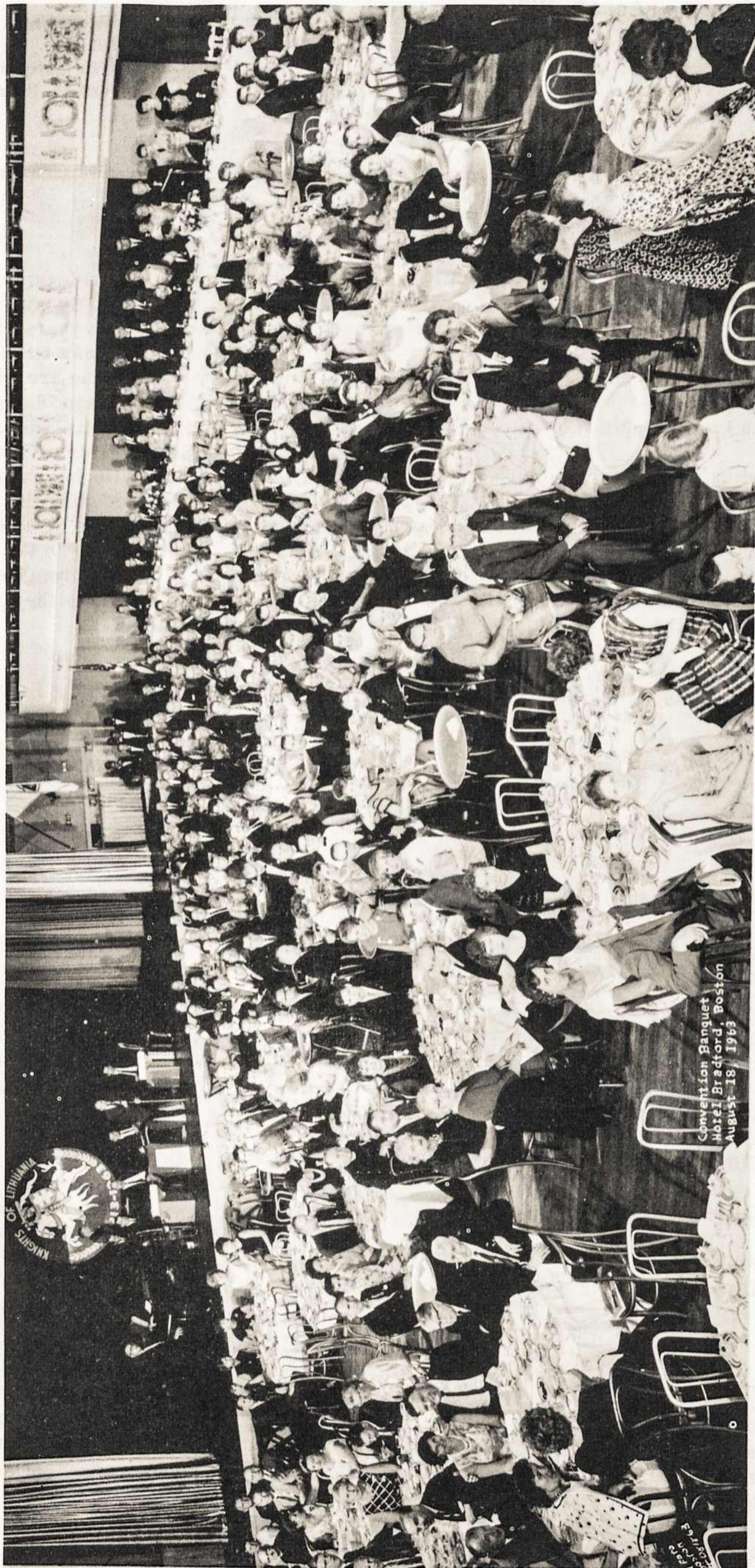
Golden Jubilee Convention Closing Banquet, Sunday, August 18, 1963 - Hotel Bradford, Boston, Mass.