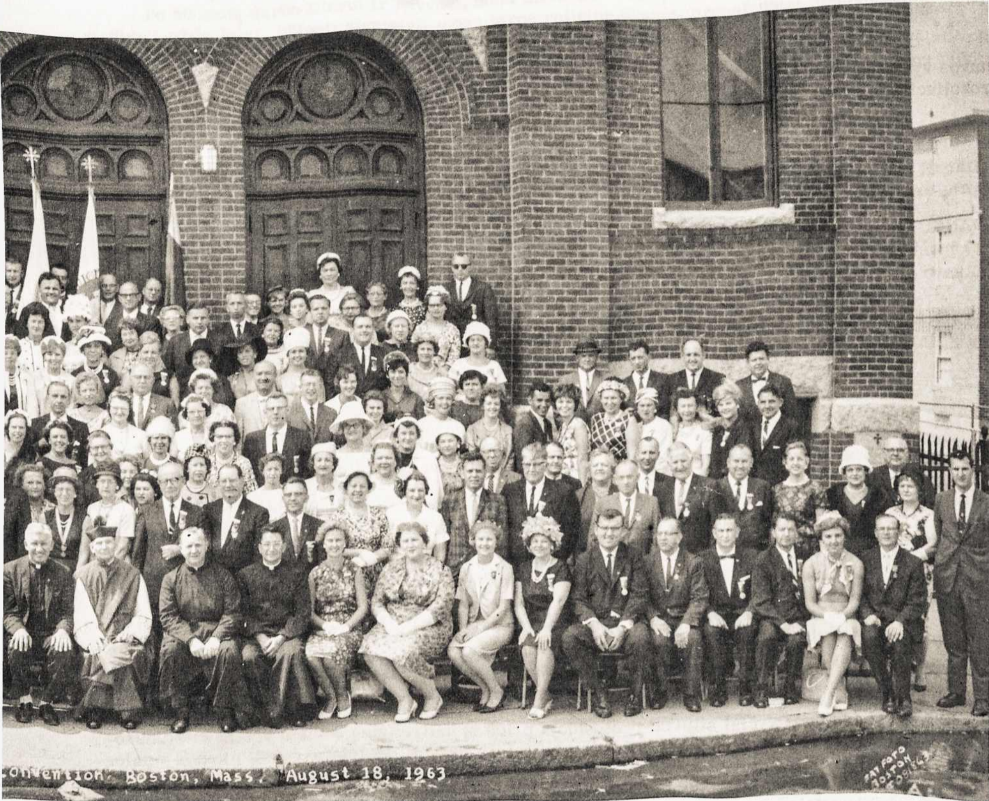
Convention, Boston, Mass., August 18, 1963