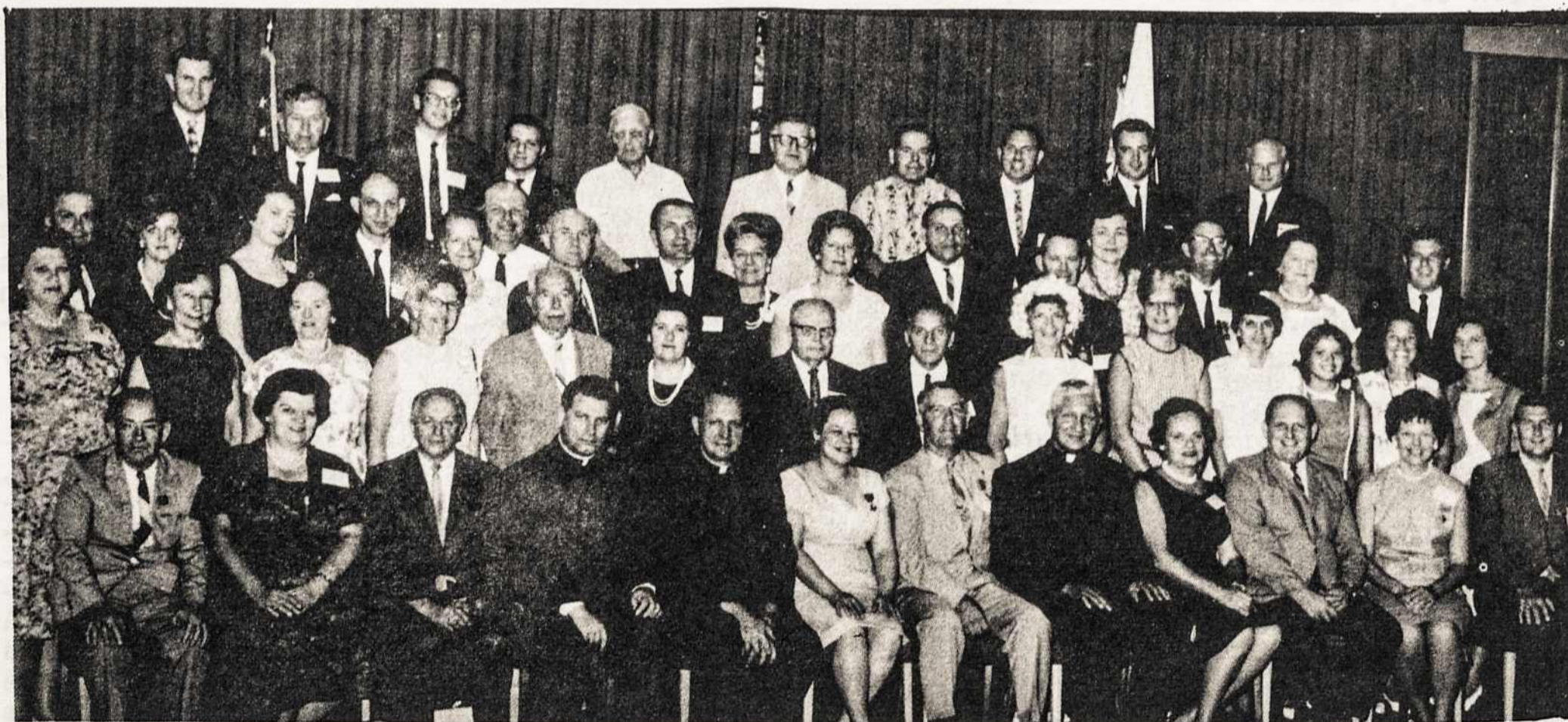
Delegates and guests at the final session on Sunday.