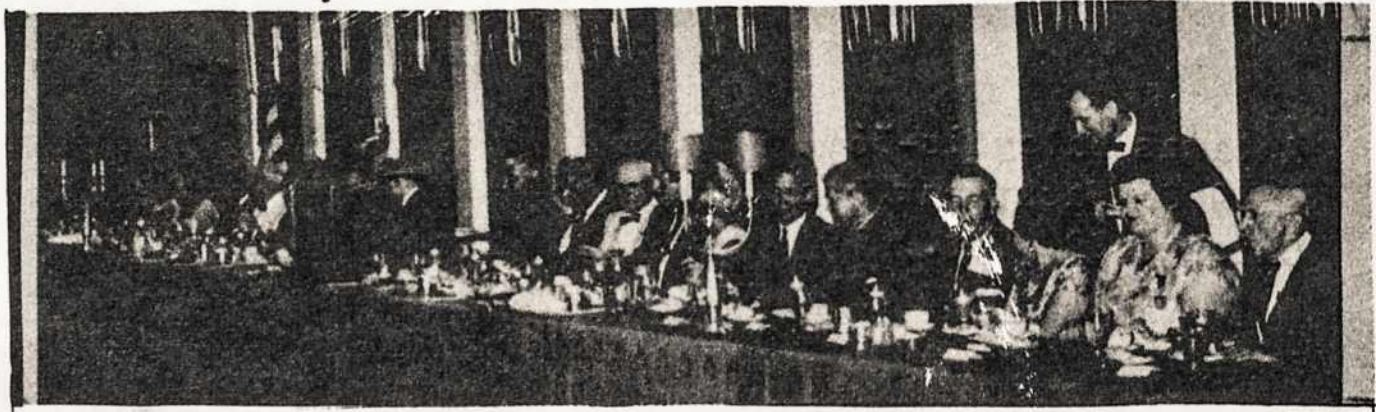
Head table at the banquet included civic, religious and Lithuanian leaders.