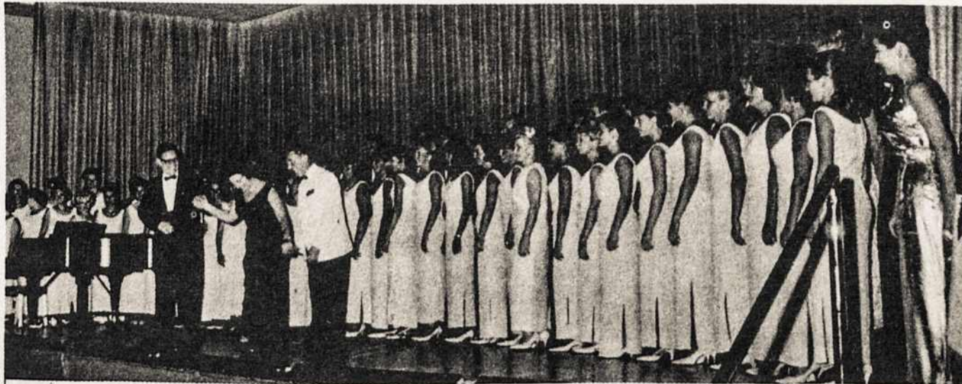
Principles of Friday's Concert graciously accept the applause of the audience.