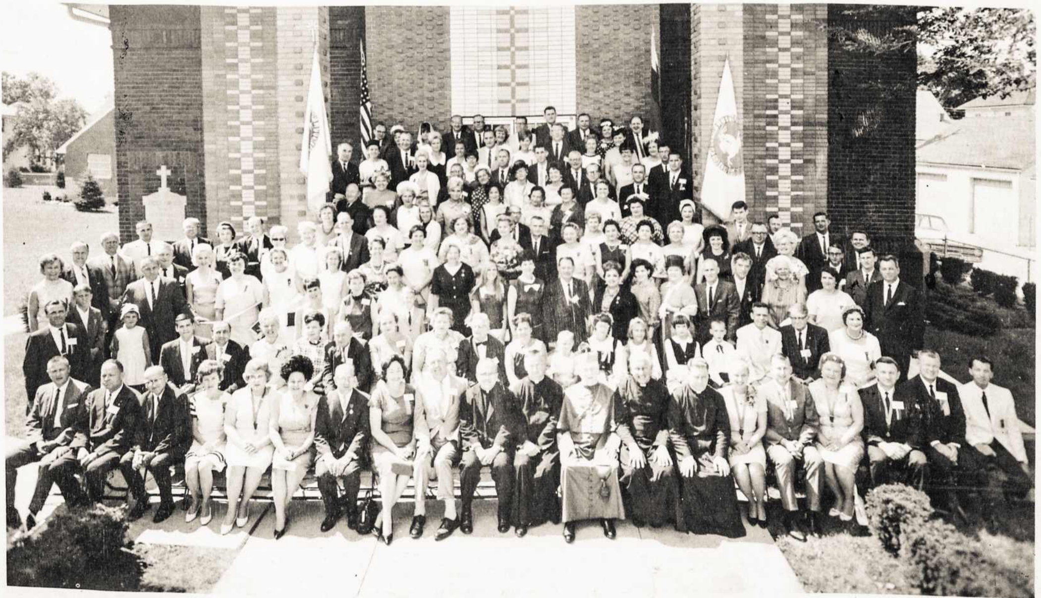
OFFICIAL 54th NATIONAL CONVENTION PHOTO