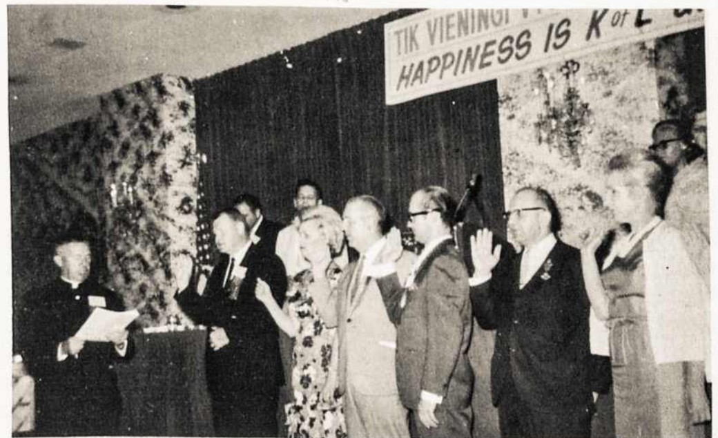
Installation of new S. C. Officers.