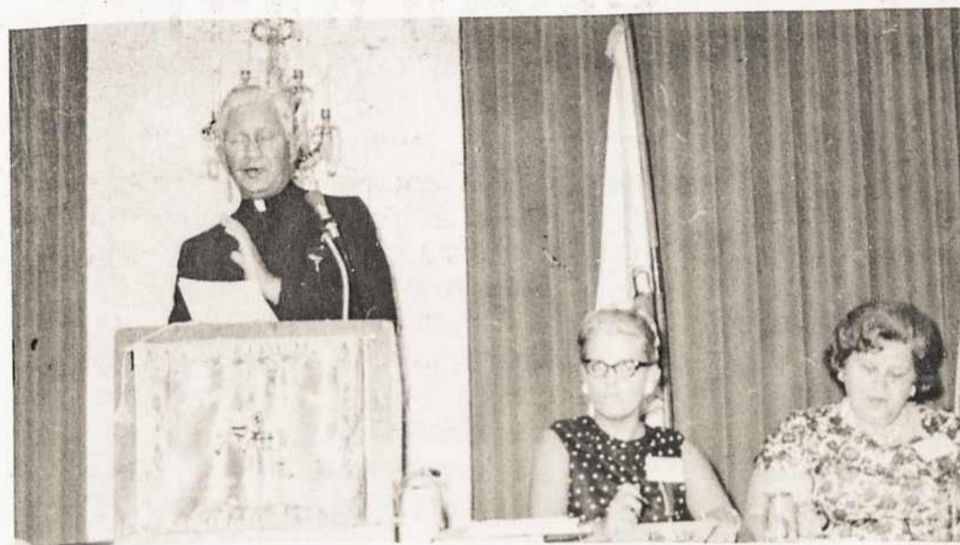
Kuopa 100 - Amsterdam Kuopa 116 - So. Worcester Kuopa 26 - Worcester

Pastebėkite, kad didysis South Bostonas, kurs taip gražiai veikė per daugelį metų, net nuo pat pradžios komisijos veikimo, jau nebeturi veikiančios komisijos. Cia tautiniu atžvilgiu skaudūs dalykas. Ką kalbėti apie kitas kuopas kurių yra virš 35, kurios komisijoje neparodo jokio veikimo. Kasmet raginame seimo dalyvius daryti ką nors savo kuopose, bet tie paraginimai nieko gero neatneša. Už tai mūsų tautinis darbas netoks koks turėtų būti. Lai nuo šio seimo visos kuopos išrenka aktyvias komisijas, kurios galėtų ir turėtų sekti gražų pavyzdį tų kuopų kurios turi veikiančias komisijas ir kurios visos vertos mūsų pagarbos.