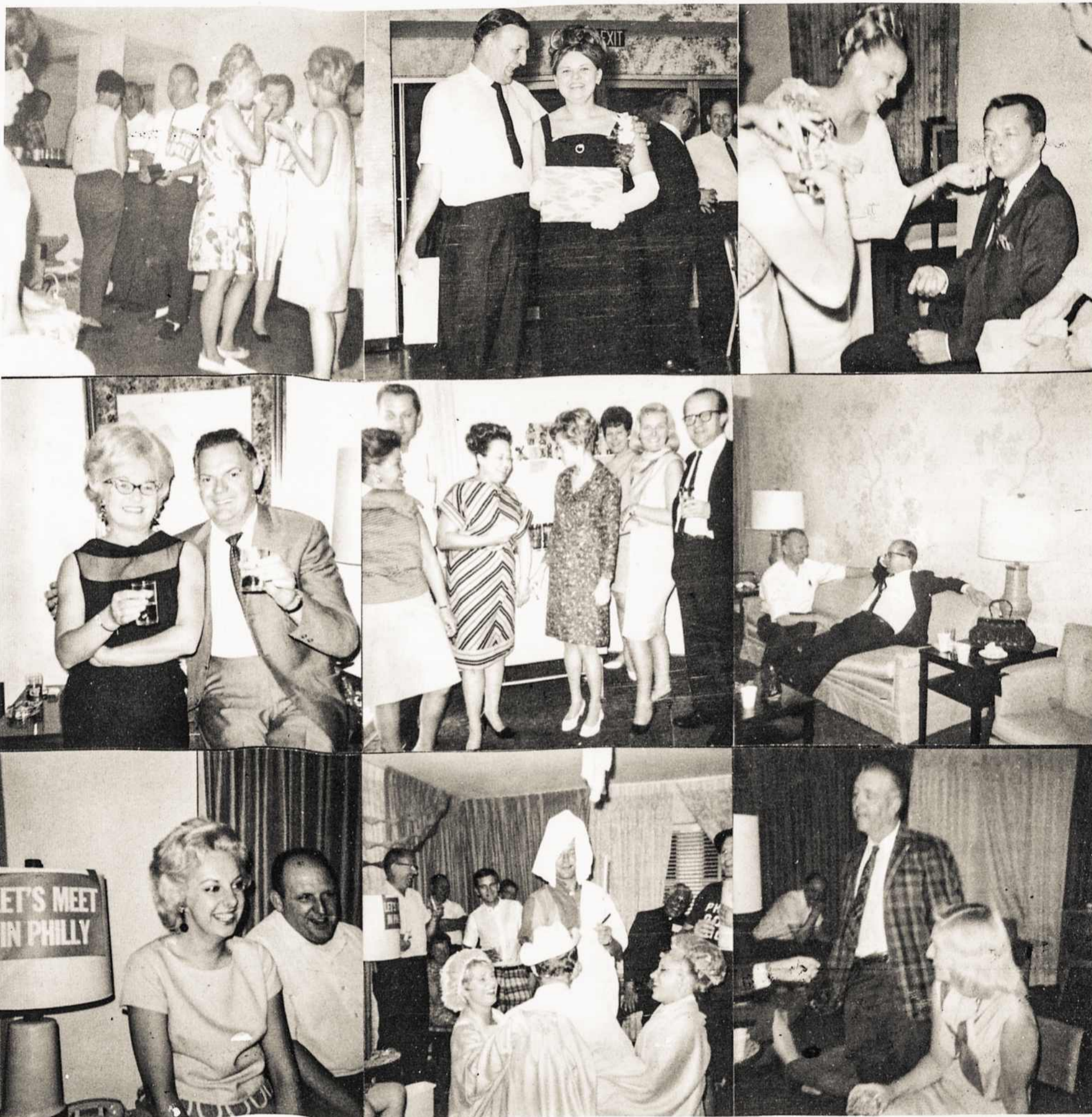
AFTER A HARD DAY'S WORK - THE DELEGATES RELAX!

Švęskime Lietuvos Nepriklausomybės 50 metų Sukaktį Philadelphijoje Laisvės Varpo Gimtinėje