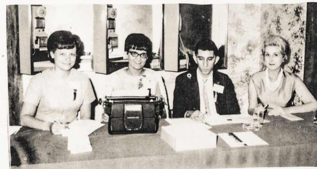
CONVENTION COMMITTEES. (Top to Bottom): Nominating Committee, Resolutions Committee, Mandate Committee and Greetings Committee.