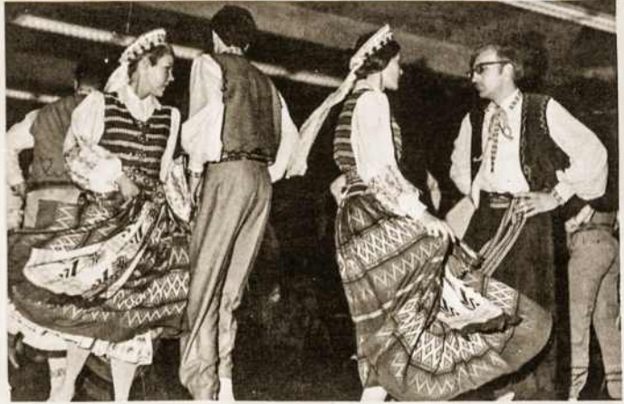
MEMBERS OF THE C-41 DANCE GROUP IN ACTION