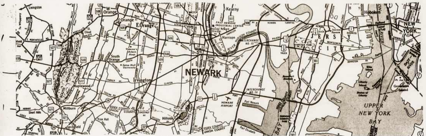
CONVENTION CITY - 1969 - NEWARK, N.J.