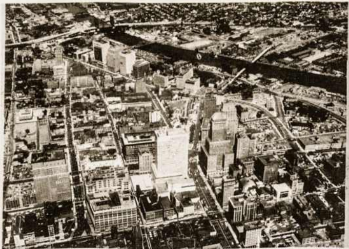
Beautiful downtown Newark

The dance group will be practicing every week throughout the summer to present an enjoyable performance in August. Don't miss it!