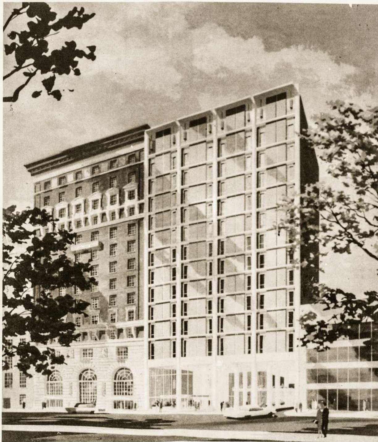
56th NATIONAL CONVENTION HEADQUARTERS HOTEL ROBERT TREAT, NEWARK, N.J.

AUGUST - SEPTEMBER RUGP - RUGS. Vol. 55 No. 7