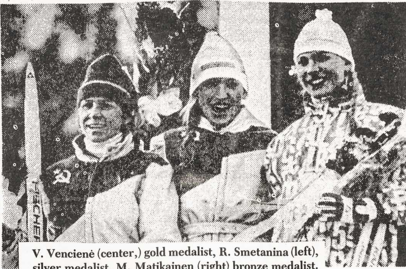
V. Vencienė (center,) gold medalist, R. Smetanina (left), silver medalist, M. Matikainen (right) bronze medalist. It is sad for us Lithuanians that Vida Vencienė had to compete under the Russian not the Lithuanian flag.